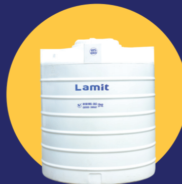
LAMIT PLATINUM (3 Layer)