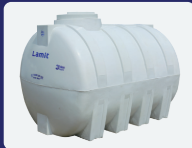
LAMIT PLATINUM 1500L

The top lid of the tank helps to protect the water from debris and unhealthy components from the atmosphere. The shape of the tanks is easy to clean on regular basis.