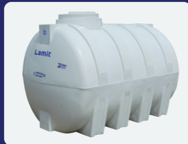
LAMIT PLATINUM WHITE ( 3 Layer )