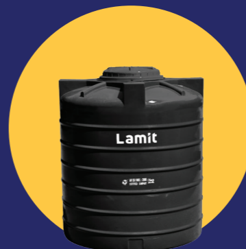
LAMIT GOLD (Blue & Black)