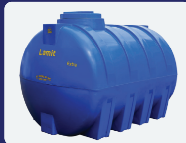
LAMIT EXTRA ( 2 Layer )