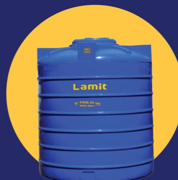
LAMIT EXTRA (Blue & Black)